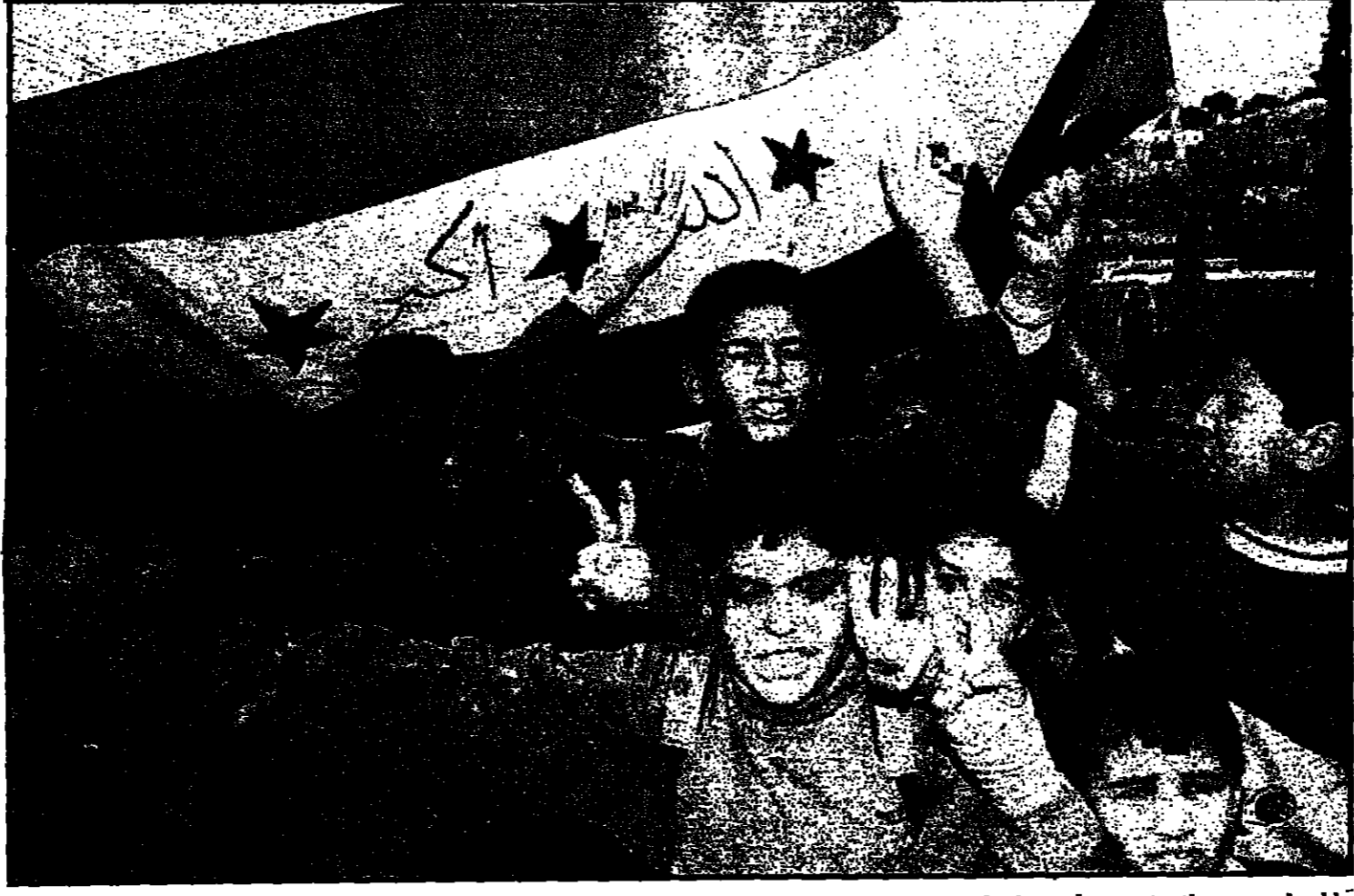
Palestinian schoolboys carrying Israeli and Palestinian flags shout pro-Saddam Hussein slogans during a demonstration organized by their school administrators at Bethlehem's Dehaishe refugee camp.